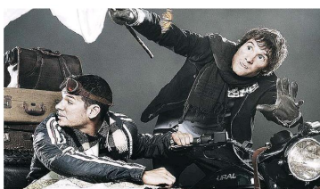
There are three seasons of Departures chronicling the adventures and challenges of two Canadian friends as they travel the world.

What happens when two Canadian dudes decide to drop everything and travel the world for a year? The end result is Departures, which originally aired from 2008-10 and currently appears on Netflix for 42 episodes over three seasons. Focused on adventure to faraway lands like the Cook Islands, Mongolia and North Korea, Departures seeks to serve as an inspiring kick in the ass for twenty-somethings everywhere who dream of taking a year off to travel but never pull the trigger. While mostly an affable exploration of scenic locales and obscure local cultures, the show does have its occasional deeper moments as it explores topics like dealing with isolation on the hyper remote Ascension Islands