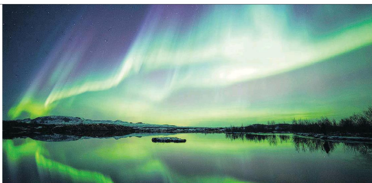
Under An Arctic Sky is a documentary about six surfers determined to catch a wave in Iceland.

Maui Condo And Home Your Piece of Paradise Kihei • Wailea • West Maui 20 Properties Including Kihei Akahi • Maui Kamalo Kamalo Sands • Waialeale Makai Call one of our Agents on Maui to save with our best rates! 844.368.1398 MauiCondo.com