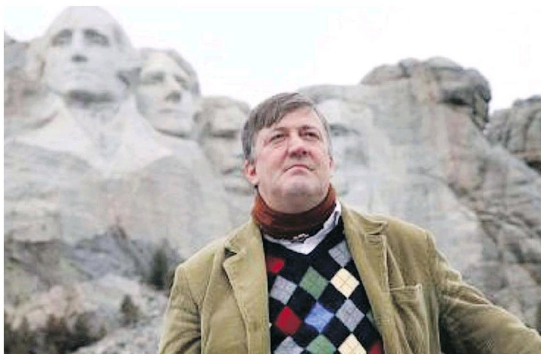
Renowned English comic/actor Stephen Fry travels to all 50 states in the span of six one-hour episodes.

Long regarded as the travel show against which all other travel shows are judged, Anthony Bourdain changed the game in food-focused television the minute his award-winning show debuted in 2013. No one could uncover the soul of a place and its people quite like the legendary former chef and author. With effortless cool and always respectful curiosity, Bourdain uses food as a window from which to open up discovery of a place and its people from all walks of life across all corners of the globe. With the final episode of his masterwork Parts Unknown having recently aired on CNN, seasons 7-10 are currently available on Netflix. Tune in to see Bourdain dining with president Obama in Hanoi, exploring Montana with Jim Harrison, and visiting Puerto Rico five months before Hurricane Maria.