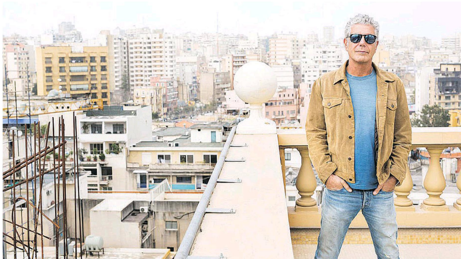
Anthony Bourdain: Parts Unknown is the show all other travel shows are compared to, and seasons 7 to 10 exploring the globe are available on Netflix.

If you'd rather put your feet up in your living room than put your arms up during an airport security pat-down, Netflix makes an attractive option for the armchair traveller in all of us. Whether you're researching your next excursion or simply want to live vicariously through those living out epic travel dreams, here are the best ways to navigate the options on Netflix. You'll want to take your shoes off for this, writes Jay Gentile .