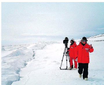
Encounters at the End of the World takes viewers to the South Pole.

or summoning the courage to publicly kickbox an opponent in a Thai kick-boxing ring. Bottom line? If these guys can do it, so can you.