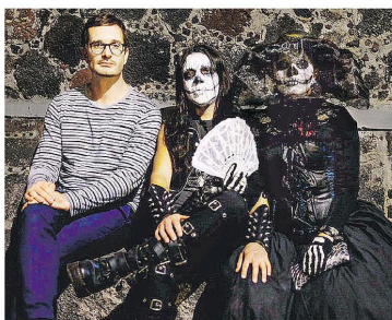
Journalist David Farrier visits unusual, and often macabre, places and people around the world. NETFLIX

scenes like a local gathering for a rooftop guitar concert. Encounters also features encounters with lesser-known features of the landscape such as Mount Erebus, the world's southern-most active volcano, paired with Herzog's narration voice-over that feels strangely at home in this inhospitable climate. With inspirational quotes from maintenance workers and massive helium balloon launches, you've never seen Antarctica quite like this.