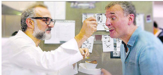
Somebody Feed Phil, a documentary series from the creator of Everybody Loves Raymond, Phil Rosenthal, takes viewers on a goodwill eating tour of the world. Along for the ride is Phil's trademark sense of humour. NETFLIX