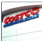
6 Costco Items About