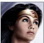
15 Facts You Didn't