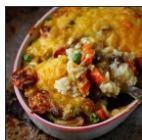
10 No-Bacon Meals