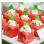
20 Pinterest Appetizers You'll Never Be Able to Replicate