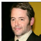
10 Actors Who Killed People In Real Life