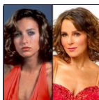
10 Celebs Who Were Unrecognizable After Plastic Surgery