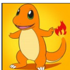
Top 5 Ways to Catch All 649 Pokemon