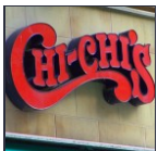
11 Biggest Failed Chain Restaurants