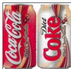
19 Sodas That Failed Miserably