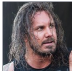
Rocker Pleads Guilty To Murder-for-Hire Charges