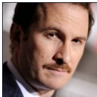
Darren Aronofsky Held Talks About Directing 'Man of Steel'