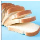
9 Foods You Should Cut Out Now