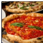
You've Never Had Pizza Like This Before