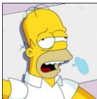
20 Secrets You Didn't Know About The Simpsons