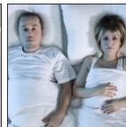
15 Signs You're About to Get Dumped