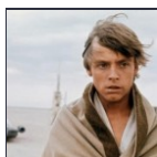
'Star Wars: Episode VII' Plot Details