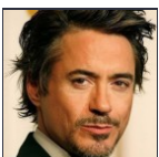
7 Guys Who Are Shorter Than You Think