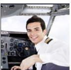
5 Careers That Ruin Your Health