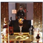
This Cocktail Is