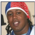
Where Are These