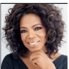
14 Services For The