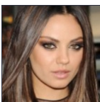
See Mike Myers