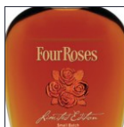
2014 Whiskies That Don't Need An Age Statement