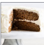
The Best Carrot Cake With Cream Cheese Frosting