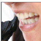
9 Surprising Ways to Whiten Teeth